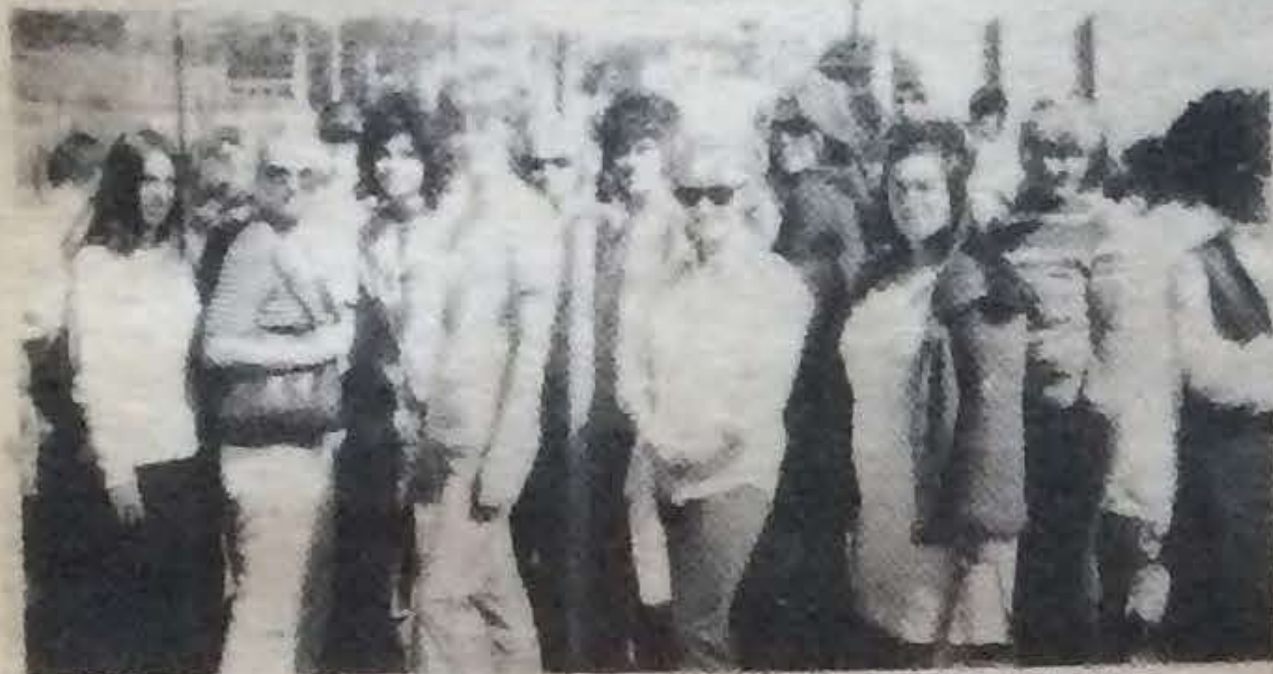
By CARLYN GODDARD

The bloody game of life roulette enacted daily on a 8.6 mile section of Ventura Frwy., better known as 'slaughter alley' claimed three more lives, raising the toll to 15 deaths during a short 2 year 9 month period.